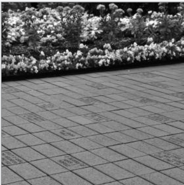
Option 1 Church Walkway

This is a thoughtful way of paying tribute and honoring a loved one or a friend.