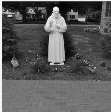
Option 2 St. Padre Pio Prayer Garden