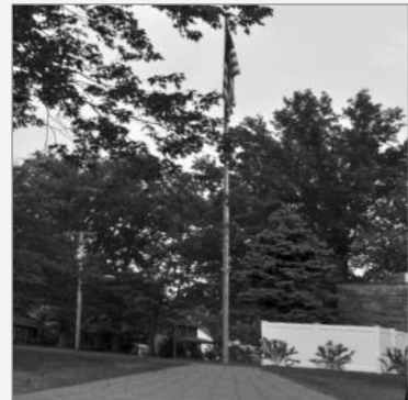
Option 3 Allegiance Walkway near the School Flagpole

3 locations for placement and 2 brick options!